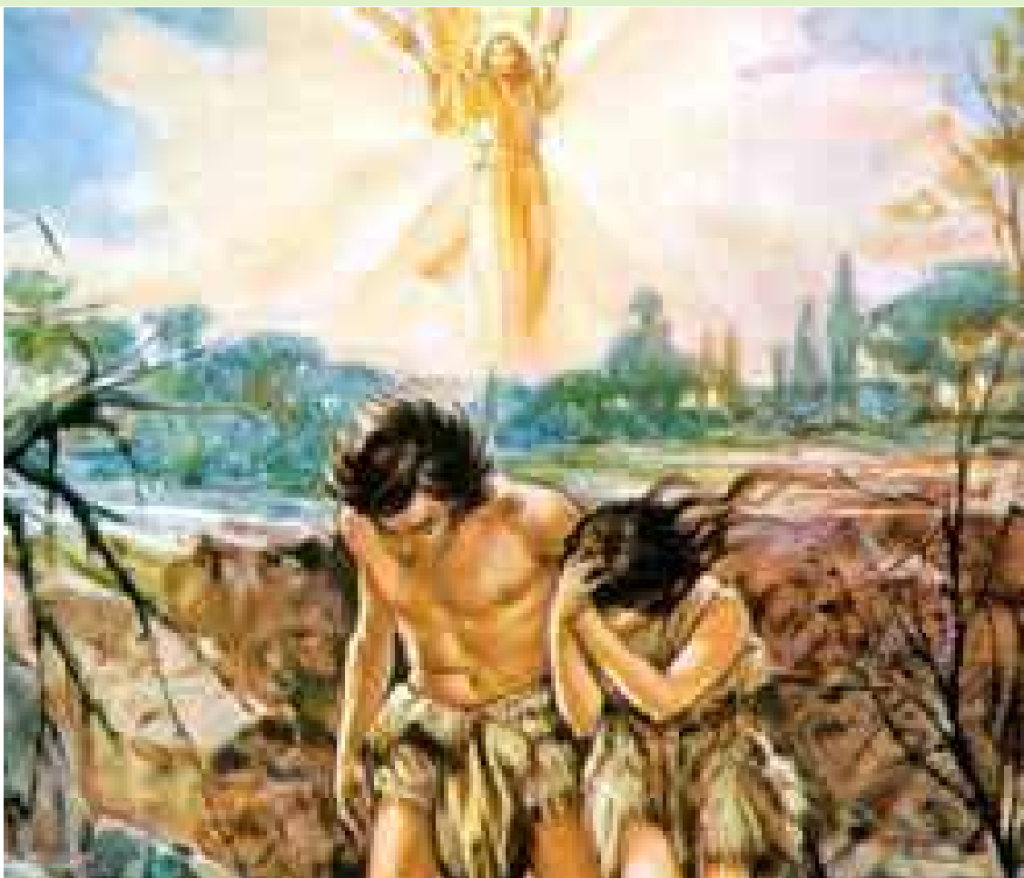
Adam and Eve expelled from the Garden of Eden

OFFICE: 1603 BROOKLYN AVE., BROOKLYN, NY 11210 Fax: 718-859-9032 Email: info@saintvincentferrer.org