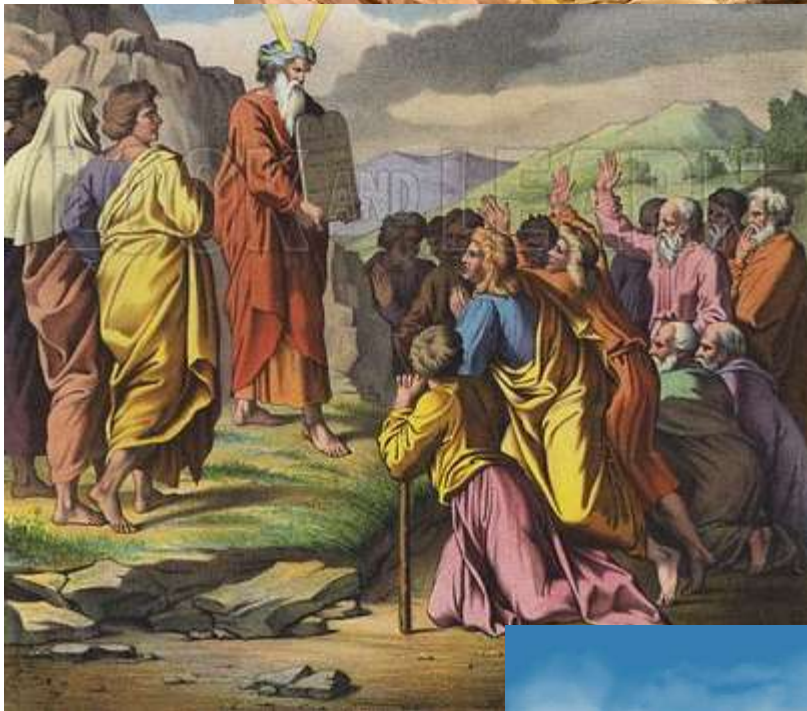
Moses with the 10 Commandments