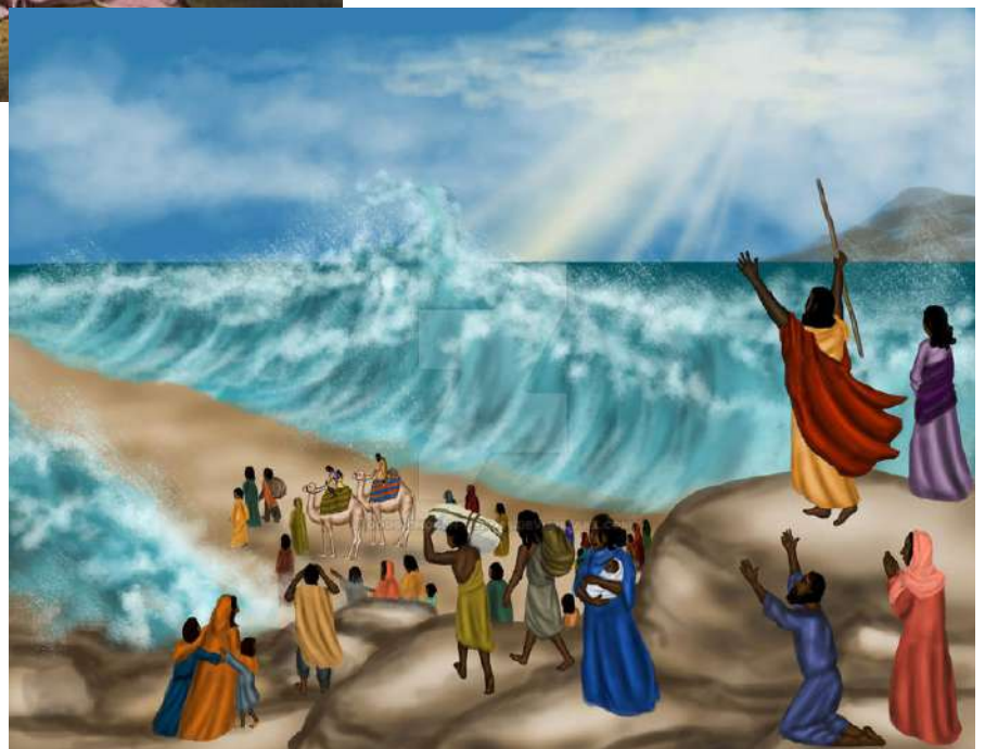
Moses parts the Red Sea