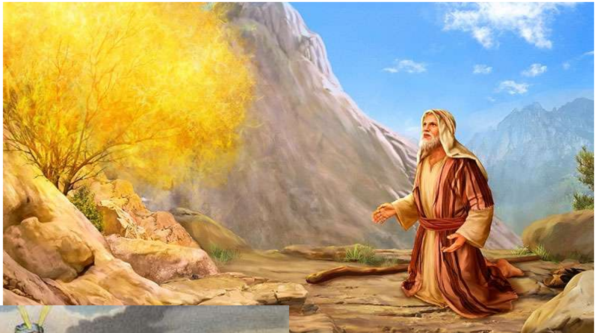
Moses and the burning bush. Moses is called by God to lead his People