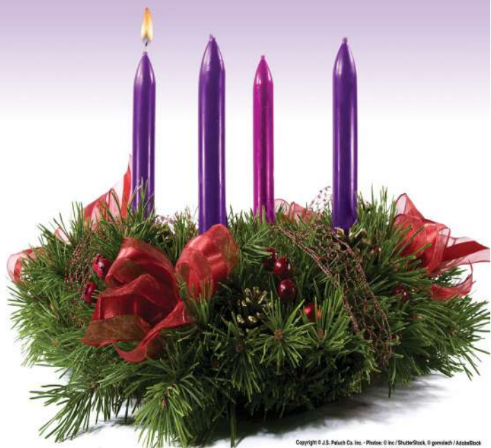
Copyright © J.S. Paluch Co. Inc. Excerpts from the Lectionary for Mass © 2001, 1998, 1997, 1994, 1970, CCC.

School Affiliation: Midwood Catholic Academy (Pre-K3 - Gr. 8) 1501 Hendrickson Street Brooklyn, NY 11234 718-377-1800 www.midwoodcatholicacademy.org