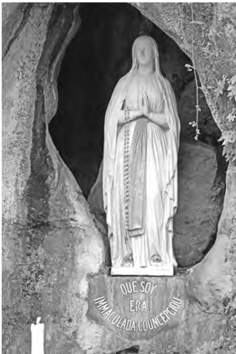
Our Lady of Lourdes February 11th