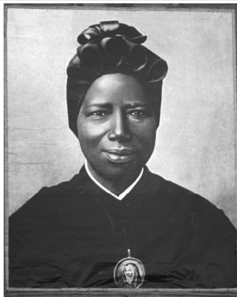
Saint Josephine Bakhita - February 8th

Monday to Friday: 9:30 a.m. - 4:30 p.m. Evenings & Weekends: By appointment