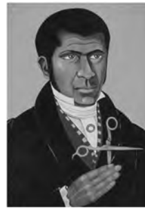
Venerable Pierre Toussaint