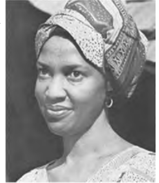
Sister Thea Bowman