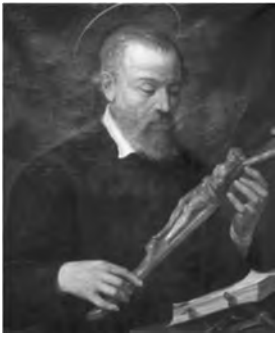
Saint Jerome Emiliani February 8th