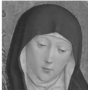
Saint Scholastica February 10th