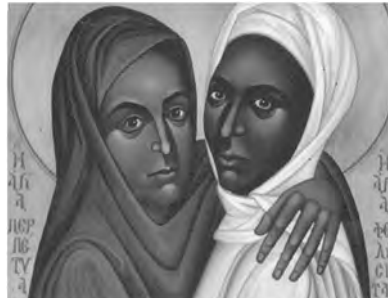
← Saints Perpetua and Saint Felicity