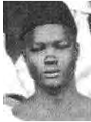
← Saint Charles Lwanga