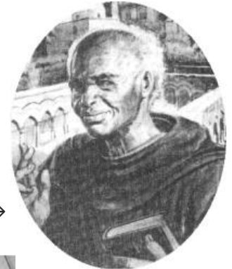
Saint Benedict the Moor →