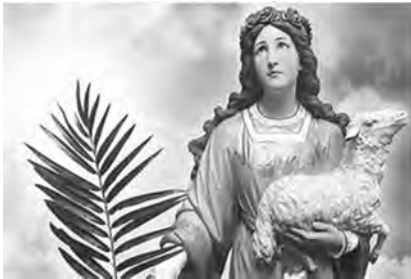
Saint Agnes January 21