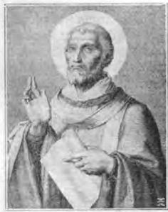
Saint Fabian, January 20

Please pray for the end to racial discrimination.