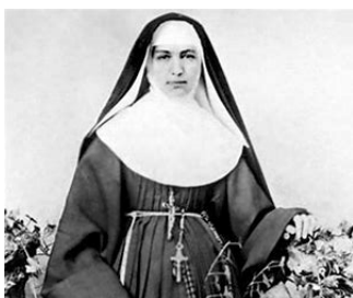
Saint Marianne Cope January 23