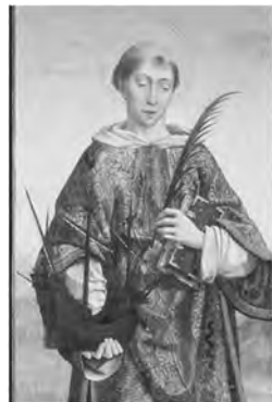
Saint Vincent January 23