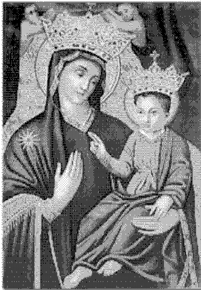
Mary. Health of the Sick

We fly to Thy protection, O Holy Mother of God. Do not despise our petitions in our necessities, but deliver us always from all dangers, O Glorious and Blessed Virgin.